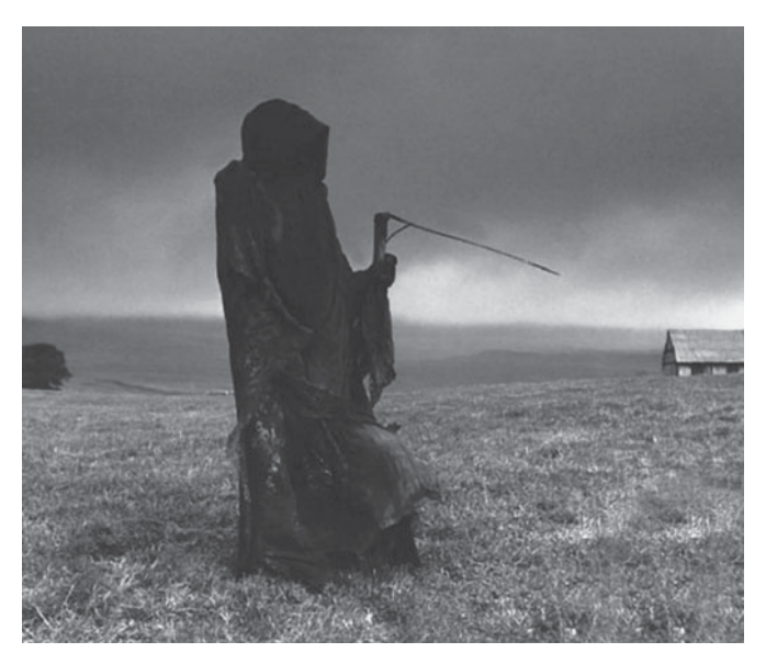
10. The Grim Reaper: a still from Monty Python's 'The Meaning of Life'

Freud set out by believing that the meaning of life was desire, or the ruses of the unconscious in our waking lives, and came to believe that the meaning of life was death. But this claim can have several different meanings. For Freud himself, it means that we are all ultimately in thrall to Thanatos , or the death drive. But it can also mean that a life which contains nothing for which one is not prepared to die is unlikely to be very fruitful. Or it can suggest that to live in an awareness of our mortality is to live with realism, irony, truthfulness, and a chastening sense of our finitude and fragility. In this respect at least, to keep faith with what is most animal about us is to live authentically. We would be less inclined to launch hubristic projects which bring ourselves and others to grief. An unconscious trust in our own immortality lies at the source of much of our destructiveness.