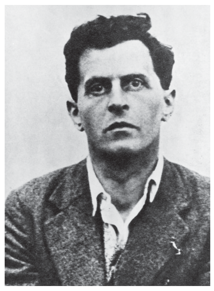
1. Ludwig Wittgenstein, commonly thought to be the greatest philosopher of the twentieth century