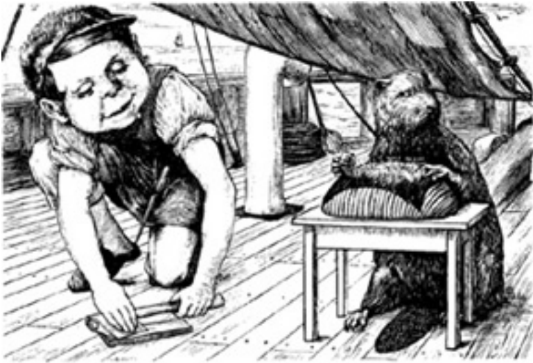
The Beaver kept looking the opposite way

The Beaver's best course was, no doubt, to procure A second-hand dagger-proof coat—— So the Baker advised it——and next, to insure Its life in some Office of note: