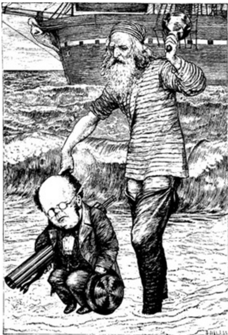
Supporting each man on the top of the tide