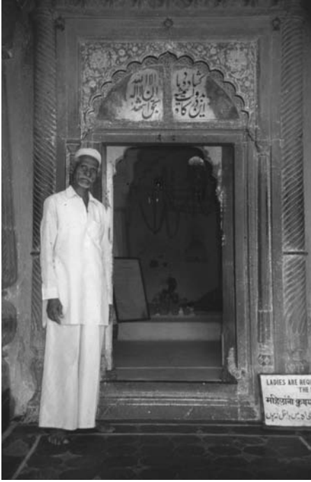
Figure 3.1 Shrine attendant ( kbādim ) before the tomb of Shāh Musāfir.

Aside from this learned role, Panchakkī had also come by this period to act as a vivid architectural reminder of the city's glorious Muslim past. Continuing to reap the financial rewards of the shrine's early endowments, the sajjāda nashīns of Panchakkī evidently still received sufficient income from the shrine's landholdings to maintain the costly delights of fountains and festive lighting ( chirāghbānī ) mentioned by visitors. It also seems likely that dervishes continued to reside in its khanaqah at the sajjāda nashīn's expense. Panchakki was thus able to find a role as the epitome of the shrunken city's Mughal past and its more cultivated traditions of Sufi piety.