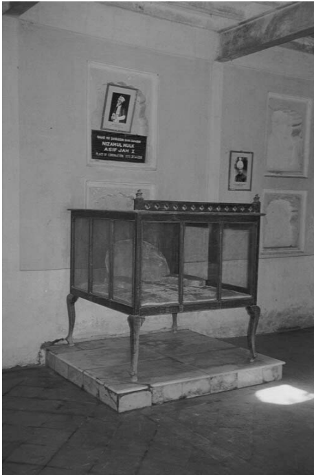
Figure 1.2 Throne ( masnad ) of Nizām al-Mulk at Nawkhanda Palace, Awrangabad.

Neither Shāh Palangpōsh nor Shāh Musāfir were literary-minded theoreticians of even the most modest kind, and their importance for our understanding of the Sufi