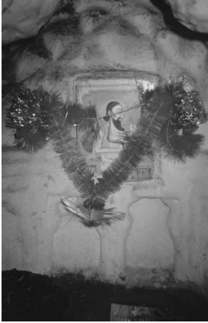
Figure 5.1 Miniature painting of Shāh Nūr at the math of Mānpūrī in Dawlatabad.

arose over the future management of the shrine that would continue for the remainder of the century. While there were personal dimensions to the dispute, including petty rivalries between a new Muslim middle class in Awrangabad and the respectable families of old, the dispute was in essence a structural one. As such, it reflected debates that had existed in the Sufi tradition for centuries about the right to inherit the charisma of a deceased master via ties of either blood or initiation. Modernizing trends in the administration of Haydarabad had meant that by the early twentieth century these old debates were being trumped by the emergence of rule by committee. Given the role of the government in the shrine's administration under Shams al-dīn, it was therefore only a small step to replace him after his death with an eight-member management committee. 10