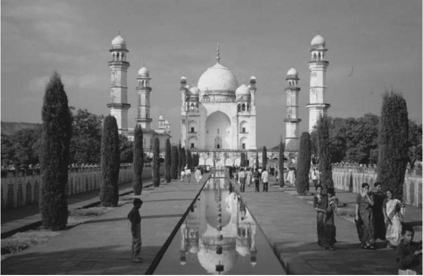
Figure 1.1 The mausoleum of Awrangzeb's wife (Bibi ka Maqbara) in Awrangabad.

Deccan (Figure 1.1). However, imperial and sub-imperial patronage led to the construction of numerous other buildings across the city, from a royal palace designed after the models of the 'red forts' of Delhi and Agra to aristocratic mansions, markets, mosques and eventually shrines for the new city's emergent Sufi saints. In 1667, during the early years of Awrangzeb's reign, the French traveller Jean de Thevenot stayed in Awrangabad and penned a memorable description of its early cityscape. After pouring praise upon the recently completed mausoleum of the emperor's wife, Thevenot went on to record his other impressions of the city.