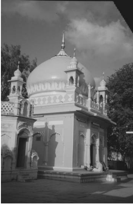
Figure 4.1 The mausoleum of Nizām al-dīn Awrangābādī.

coincidence of Dussehra and Muharram. 10 Considering the long tradition of the common celebration of ‘Ashūra, the tenth day of the month of Muharram, by both Hindus and Muslims in the Deccan, these administrative policies had great significance.