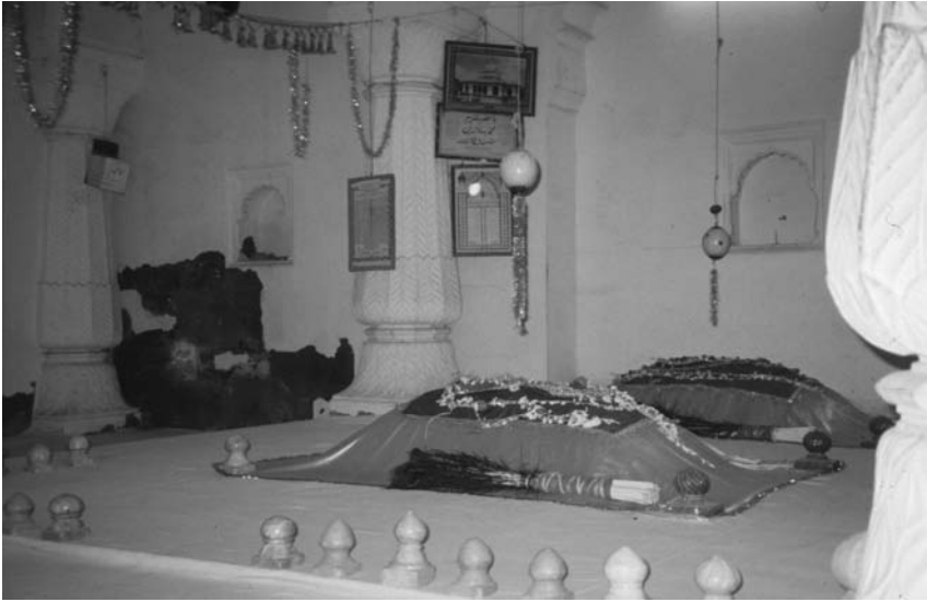
Figure 2.2 The tombs of Shāh Musāfir and Shāh Palangpōsh.

as Fazl al-dīn. 42 The shrine was also described by Sabzawārī at this time as a centre of pilgrimage for travellers from beyond the city. 43 Such visits may well have coincided with the celebration of the death anniversary of Shāh Musāfir and Shāh Palangpōsh, which was celebrated throughout this period. A document referring to expenses at the 'urs in 1186/1772 of 678 rupees suggests that the anniversary was celebrated on a lavish scale. 44 This line of sajjāda nashīns continued through four more successors, all of whom were buried in the forecourt of Shāh Musāfir's mausoleum.