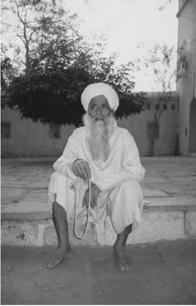
Figure 4.2 A Sufi pilgrim at the shrine of Nizām al-dīn Awrangābādī.