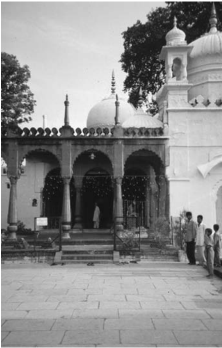
Figure 2.1 Panchakkī, the shrine of Shāh Musāfir and Shāh Palangpōsh.

The tradition of Shāh Palangpōsh and Shāh Musāfir also maintained its position of early prominence in the city during the eighteenth century. Shāh Musāfir's successor Shāh Mahmūd oversaw the expansion of the shrine to the degree that it acquired much of the surrounding property along the riverbank beneath the city walls (Figure 2.1). Yet with their own gateway in the city walls, the Panchakkī saints' position as spiritual gatekeepers to the city at large seems to have been regarded more